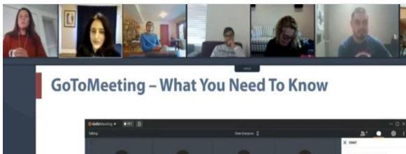
Safe, in-person and virtual public workshops and open houses, for citywide topics and individual neighborhoods