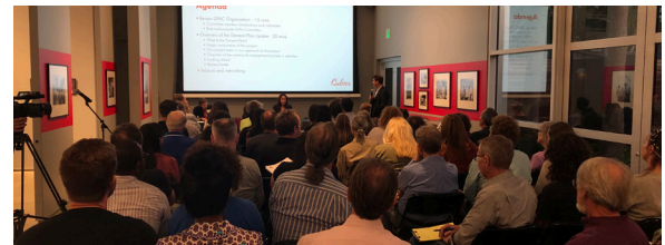
Development of a General Plan Advisory Committee to help guide the process