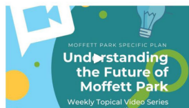
Educational videos and events with guest speakers on specific topics of interest

Hear a few words from the Moffett Park Specific Plan's project manager as she introduces the series: