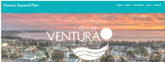
Project website with information and updates

The City will host many events and activities to engage Ventura residents and stakeholders. These activities will be designed to allow the public to participate in a way that is easy, user friendly, and accessible to everyone. Some of the key activities that will occur throughout the process are: