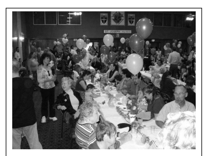
"One City" Thanksgiving Day - 2008

- from The Unitarian Universalist Church's "Lift Up Your Voice" project (http: www.uuventura.org/luyv) - a collaborative approach to working with the homeless and marginalized segments of our community to end homelessness.)